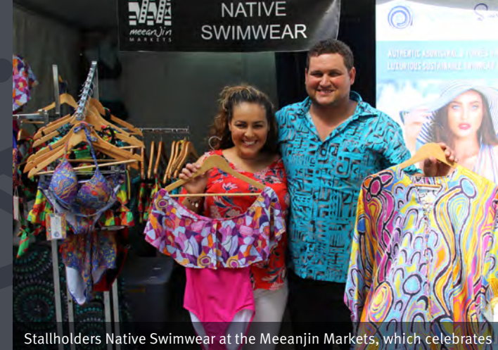
Aboriginal and Torres Strait Islander arts, craft and culture through market stalls, performances and workshops

We will harness relationships, strengthen respect, and activate opportunities for Aboriginal and Torres Strait Islander businesses and innovators.